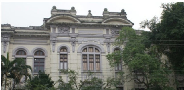
2018 - Produced and edited by USP International Cooperation Office