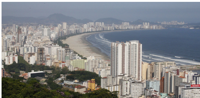
Aerial view of Santos ^