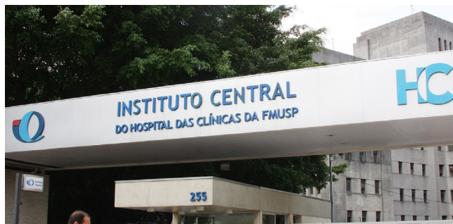
2018 - Produced and edited by USP International Cooperation Office