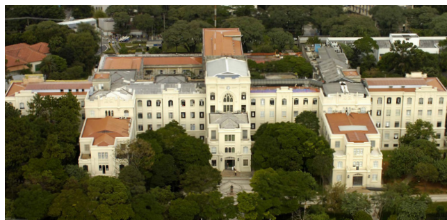
Aerial view of the Medicine School