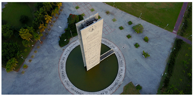
2018 - Produced and edited by USP International Cooperation Office