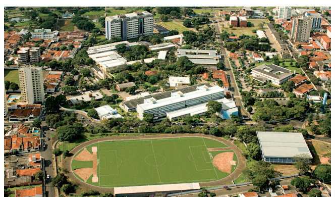
Aerial view of Bauru campus Bauru campus entrance