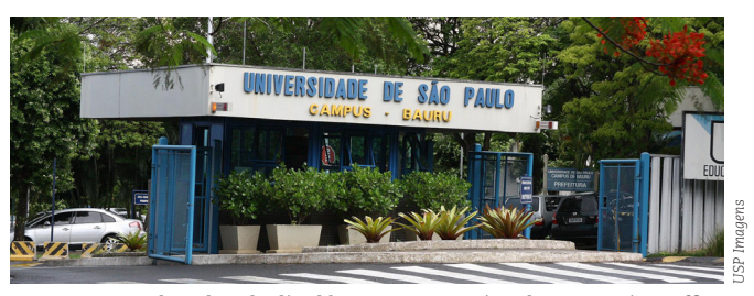
2018 - Produced and edited by USP International Cooperation Office