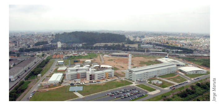
USP Leste 🔨 EACH campus 🗸